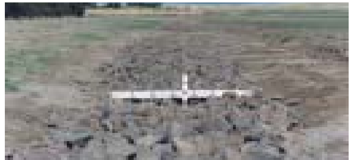
6. One of the finished large crushed rock treatments.