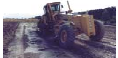
2. The roadgrader deepening the "V" drain by about 300mm ready to backfill with large crushed rock.