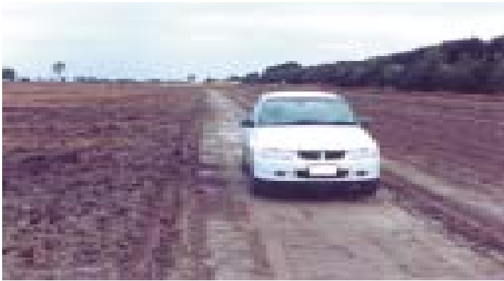
1. Using a dumpy level we determined the falls we had to play with and engaged a roadgrader to widen (25m) and heighten (650mm) the existing wide raised bed headland. With the roadgrader we placed a slope on the apron between the ends of the beds and the main drain. For our purposes, the main drain is "V" shaped and not flat as normally recommended.

By their very nature, raised bed paddocks are a complex of raised soil areas set between surface drains. These surface drains of course are the first areas to get wet and the last to dry out. In particular, trafficking through headland drains has proven very difficult in some paddocks which have little slope. Southern Farming Systems, with funding from the GRDC have a headland management project established on our concept farm at Winchelsea. The following photos summarise part of our attempt to better manage our headlands. The headland chosen is relatively flat but very low-lying and it has proven difficult to move water out of the paddock previously. As we all know, the main collector drains need to be open to move water quickly but safely from the paddock. To remove the remaining puddles and other surface water we have modified the main drain with three treatments. The first is using large (40mm - 200mm) crushed rock to act as an underground drain and provide a firm surface for the tractor. The second is an underground drain (100mm slotted plastic pipe) backfilled with 40mm clean gravel. The final treatment is a control. These three treatments are replicated twice down the headland.