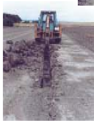
3. A backhoe digs a trench about 400mm deep ready to install the underground pipe for our second treatment. Although we used a 300mm wide bucket, probably only a 100mm wide trench would be required.