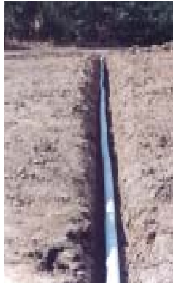
5. To relieve the drainage water from each treatment a drainage pipe has been taken across the headland to the fence line.