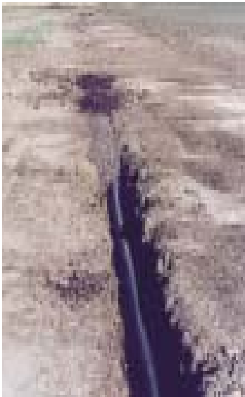
4. The 100mm slotted agricultural drainage pipe laid in the trench.