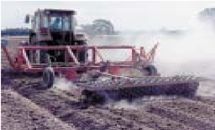
Bill Day busy making 2 beds at a time on a hot dusty day in April.

Two Victorian farmers with a mission to plough straight ahead. They may be poles apart in the area they crop, but Bill Day from Nagambie and Simon Gillet from Ballan have the same ideas. That is to install raised beds without full soil disturbance. Bill is going straight into pasture while Simon is going into stubble ground. How are they going? See pages 4 & 5 for the full story.